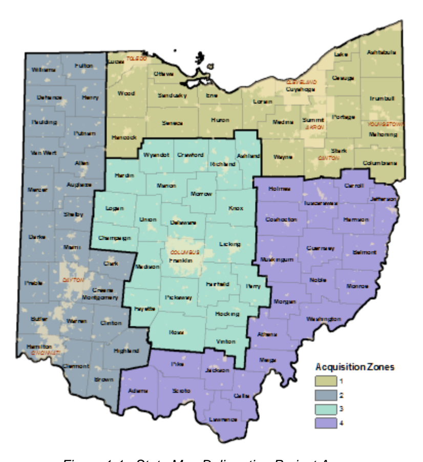
Figure 1-1 State Map Delineating Project Areas

Twenty-one (21) counties comprise the 2020 Southeastern Acquisition Area (~10,385.9 sq. mi.) include: ADAMS, ATHENS, BELMONT, CARROLL, COSHOCTON, GALLIA, GUERNSEY, HARRISON, HOLMES, JACKSON, JEFFERSON, LAWRENCE, MEIGS, MONROE, MORGAN, MUSKINGUM, NOBLE, PIKE, SCIOTO, TUSCARAWAS, WASHINGTON.